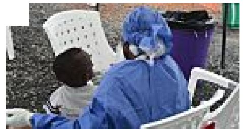
Latest Ebola news in 15 seconds