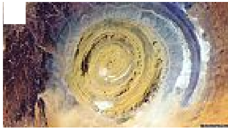
Photos of Earth's beauty from space