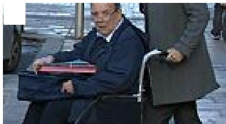
Groping teacher's decade of abuse