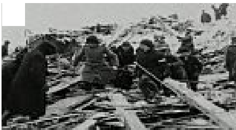
Unseen pictures of WW1 explosion